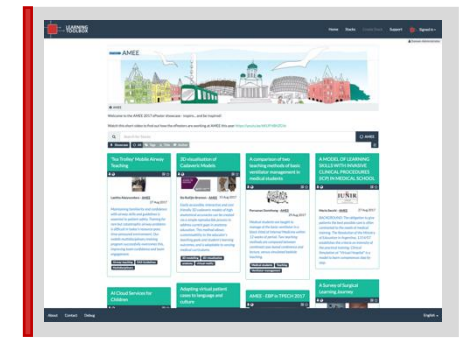
AMEE 2017 ePoster Showcase Page

You can explore and interact with all the ePosters on the AMEE ePosters Showcase page <a href="https://my.ltb.io/#/showcase/amee">https://my.ltb.io/#/showcase/amee</a>